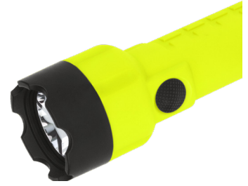
Large, textured button