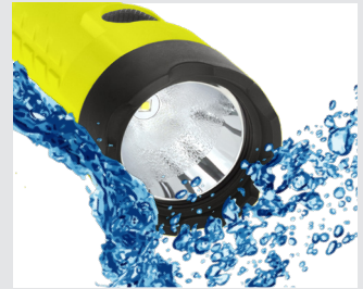
Durable polymer body is impact & chemical resistant